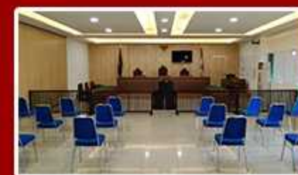
Judicial Practice Room - 4th Floor