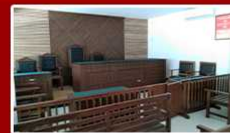
Moot Court Room - 3rd Floor