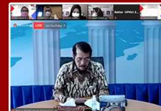
Dr. Anwar Usman, S.H., M.H. as a speaker of 3rd National Conference on Law Studies (INCOLS)