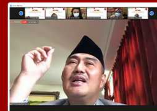
Prof. Dr. Jimly Asshiddiqie, S.H., M.H. as a speaker of 3rd International Conference on Law Studies (INCOLS)