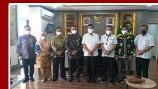
Faculty of Law UPN "Veteran" Jakarta conduct hearings to Assistant Attorney General of General Crime Unit, The Attorney General of the Republic of Indonesia