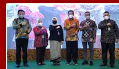
Empirical Study between Regional Representative Council Republic of Indonesia & Faculty of Law UPN "Veteran" Jakarta